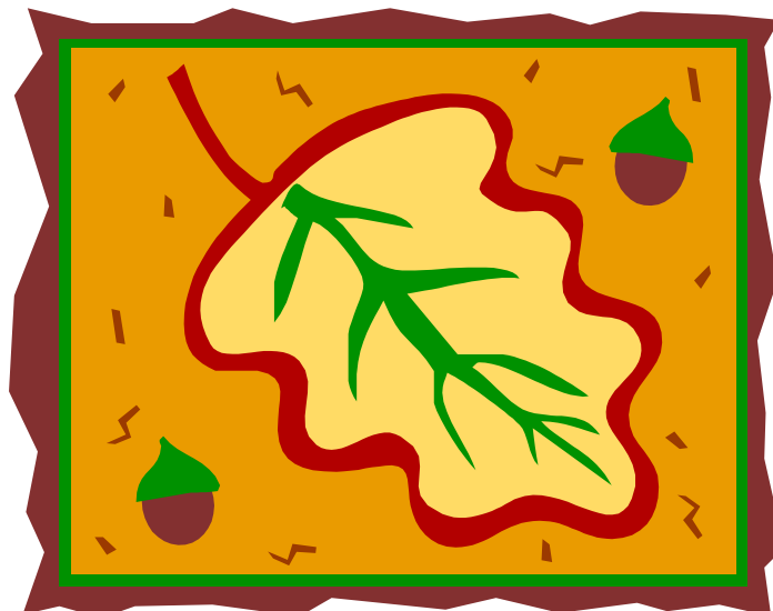
Delicious autumn! My very soul is wedded to it, and if I were a bird I would fly about the earth seeking the successive autumns. - George Eliott

Over 30 partners, agency, government entities, and individuals have come together to offer their time, services, and monetary gifts to ensure the completion of this project. School maintenance and janitorial personnel will perform routine maintenance and janitorial services for the field, fences, buildings, and dugouts. The school's Building Trades Class will provide any needed extensive maintenance repairs. Success abounds everywhere !!!