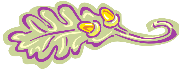
Autumn is a second Spring where every leaf is a flower. — Albert Camus

The facility realized its full potential beginning in the spring of 2008. It provides a great opportunity to local producers in marketing