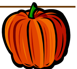
It is only the farmer who faithfully plants seeds in the Spring, who reaps a harvest in the Autumn. — B. C. Forbes

Eligible Counties for the 2009 class are: Cumberland, Fentress, Morgan, Overton, Pickett, Scott.